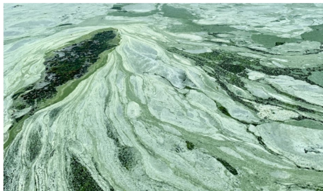
A large cyanobacteria bloom on Lake Monona in Madison on June 29, 2019. Cyanobacteria has been present in Lake Monona almost all of June.

Wisconsin DNR Identifies 92 New Waters As 'Impaired'